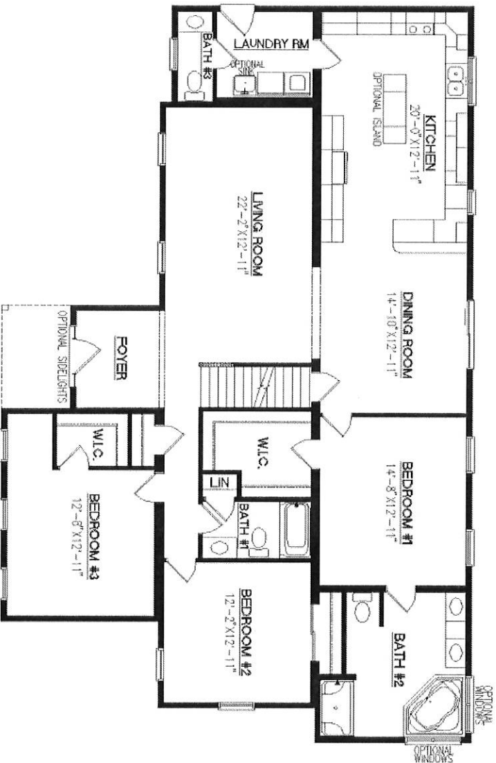
First Floor (w/ Basement)

Note: Renderings are for illustrative purposes only and may vary per series standard specifications.